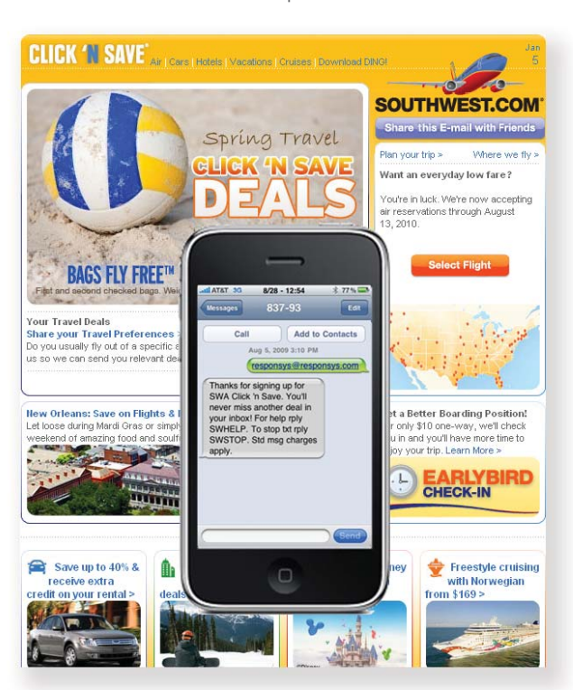
Southwest Airlines uses the mobile channel to acquire email permission.

Only with permission and a cross-channel, holistic view will marketers be able to reach their customers at the most influential moments of the lifecycle. To adapt, marketers need to rethink the way they approach marketing – one that drives both higher conversion rates as well as higher levels of efficiency, revenue and engagement from this new cross-channel customer experience.